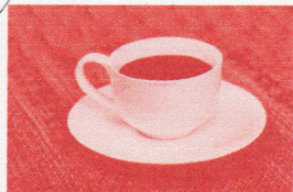
In a day of tiredness, coffee is needed to keep up with all the problems of work and life.