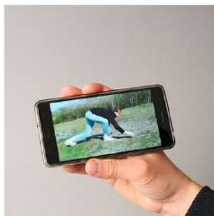
2 Helmut Smits, Upright Evolution . Display human evolution through the phone screen.