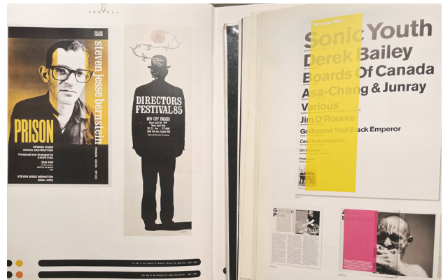
The left: Non-format: Love Song The right: 1, 2, 3 Color Graphics