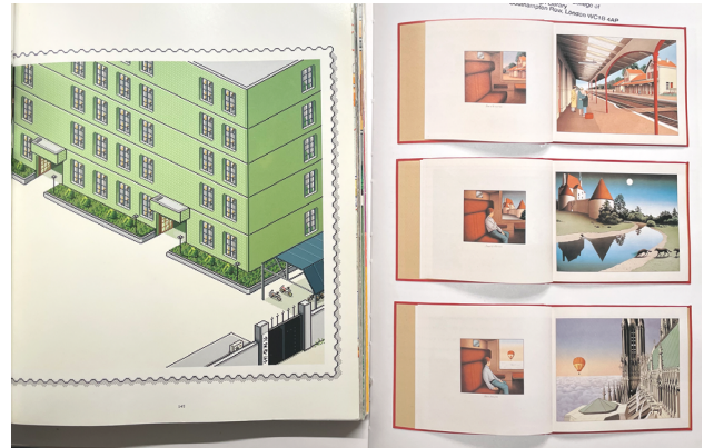
The left: 1x1: Pixel-Based Illustration and Design The right: Creativity for Graphic Designers