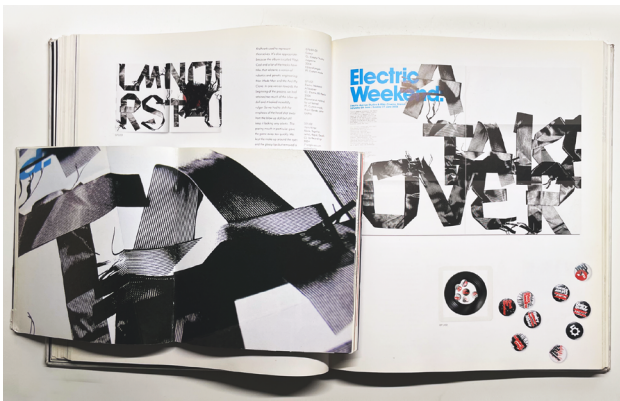
Above: Non-format: No. 045 (Design & Designer S.) Below: Non-format: Love Song