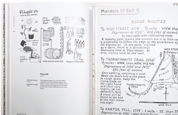
The left: Monochrome Graphics The right: The New Handmade Graphics